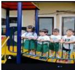
Figure 7: Instagram post