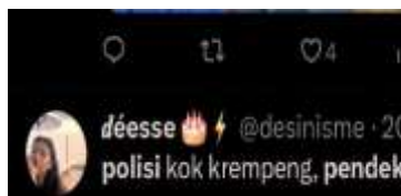
Figure 10: Comment on post

The comment “polisi kok krempeng, pendek pula” has a connotative meaning that