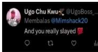
Figure 18: Comment on post

The comment “And you really slayed 100 ” denotatively, the word ‘slay’ means “to kill” or “to defeat.” Connotatively, it is clearly not about that, but rather a compliment for someone's appearance who looks incredibly cool, confident, and charming at a wedding. The commenter is acknowledging that the person who posted the content truly gave her all and successfully “killed” the atmosphere with her charms.