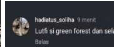
Figure 6: Comment on post

The comment “ Lutfi si green forest dan selalu 😊” found on this social media post is an example of an expression with connotative meaning and positive emotional characteristics. Denotatively, the phrase “ green forest ” refers to a green forest, and the phrase “ dan selalu ” indicate consistency, while the emoji “😊” symbolizes a friendly smile. However, connotatively, the expression “ green forest ” is not intended to literally refer to a physical green forest or the color green, but rather to describe someone’s nature as being like a green forest, calming, cool, natural, and refreshing to others. This expression is used metaphorically to praise Lutfi’s consistent nature, which is calming and pleasant to those around him.