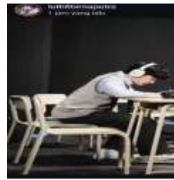
Figure 5: Instagram post