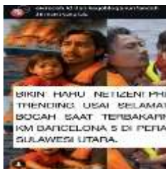
Figure 13: Instagram post