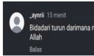
Figure 4: Comment on post

The comment “ Bidadari turun darimana nih 😍😍😍 Masha Allah” on this social media post is an example of an expression that has a connotative meaning with positive emotional characteristics. Denotatively, the word “ bidadari ” refers to a beautiful creature from heaven, “ turun ” indicates movement from above to below, the heart-eyed face emoji “😍” conveys a sense of falling in love, and the religious expression “ Masha Allah ” is used to express awe at God’s creation. However, connotatively, this comment does not literally refer to angels from heaven descending, but rather serves as praise filled with admiration for the person in the post who is perceived as extremely beautiful and captivating.