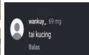
Figure 12: Comment on post

The comment “tai kucing” has a connotative meaning that implies sarcasm toward something considered excessive or unserious in the post above. Denotatively, “tai kucing” means cat feces, which is synonymous with something dirty, trivial, and worthless. However, in this context, the expression is used connotatively to mock the content of the post, which seems overly dramatic, excessively romantic, or, in slang terms, “alay.” For the commenter, this expression is a way to express that the writing feels funny rather than touching or serious.