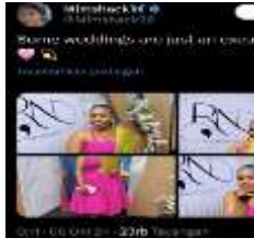
Figure 17: Twitter post