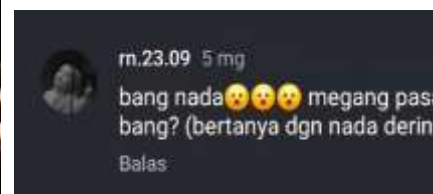
Figure 16: Comment on post

The comment “ bang nada 🤔🤔🤔 megang pasar mana, bang? (bertanya dgn nada dering) ” on that post has a connotative meaning that is both humorous and admiring. Denotatively, the sentence seems to be asking about the location of a market managed by someone named “ Bang Nada ”, complete with a playful tone of “ bertanya dgn nada dering. ” However, connotatively, the comment is actually a humorous and casual jab at the woman's strong and confident appearance, to the point where she is mistaken for a tough guy or a market boss with significant influence. This expression also conveys both admiration and surprise, as it is rare to see a woman with such a muscular build and confident posture. The comment demonstrates how connotative meanings often contain light hearted humor with a positive tone, while subtly incorporating hidden praise that makes the post more lively and engaging.