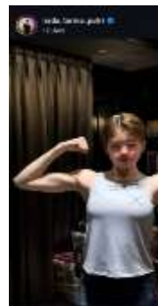
Figure 15: Instagram post