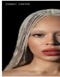
Figure 1: Instagram post