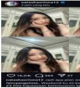
Figure 3: Instagram post