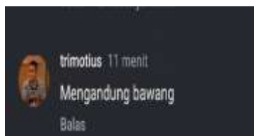
Figure 14: Comment on post

In the post above, the image of a father helping a small child as the boat they are on catches fire carries a connotative meaning filled with emotion. The comment “ mengandung bawang ” literally refers to something that actually contains onions. However, in a connotative sense, this expression is used to describe a heartwarming situation that makes people who see it feel like crying, like eyes stinging from onions. In this context, the father's brave and caring act