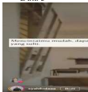
Figure 11: Instagram post