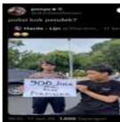
Figure 9: Twitter post